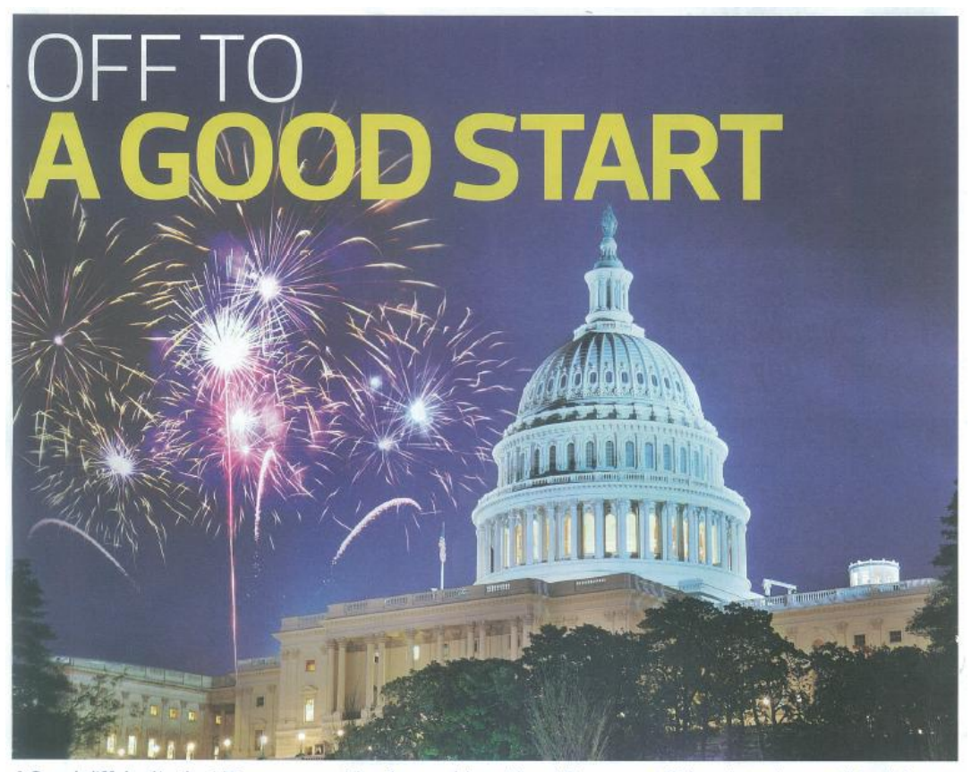
A fiscal cliff deal in the US proves positive for world equities. We present 10 local stocks worth looking at.