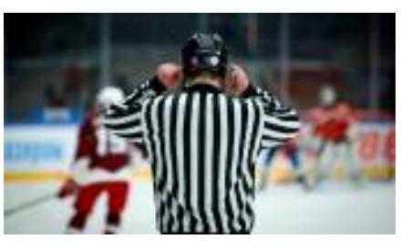
Unsung heroes in the world of sports