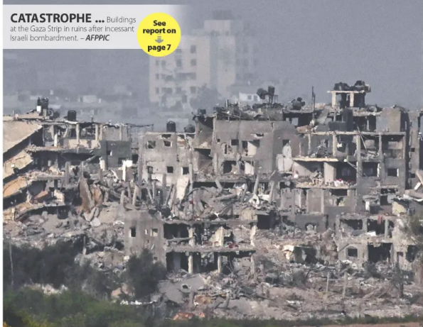
CATASTROPHE ... Buildings at the Gaza Strip in ruins after incessant Israeli bombardment. See report on page 7